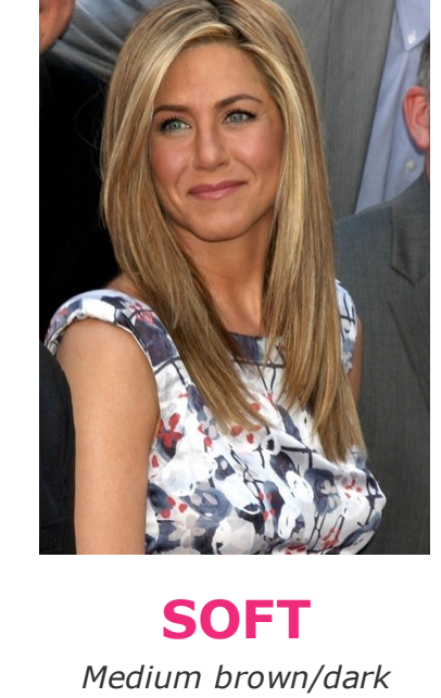
blonde hair, medium intensity eyes, medium skin tone (low contrast)