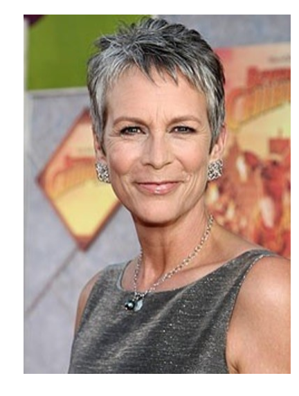
Silver hair, any color eyes, medium skin tone