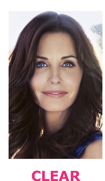
Dark brown/black hair, bright colored eyes, fair skin (high contrast)

Contact me to set up your Personal Style Analysis appointment or better yet, grab your girlfriends and do it together as a fun group party for the best rates!