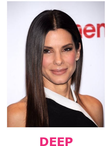
Dark brown/black hair, dark eyes, medium to dark skin tone