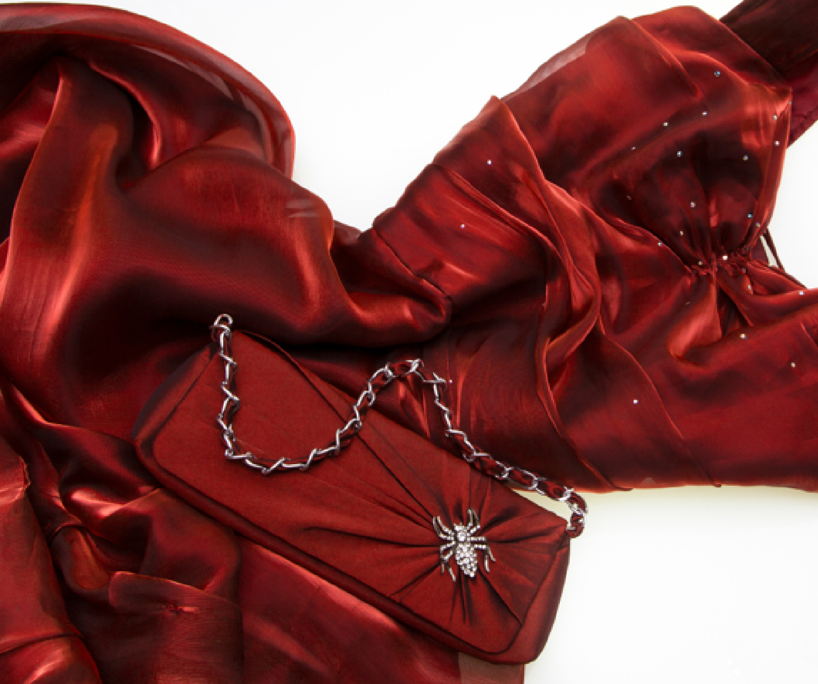
We all love a great scarf, and the best one is the scarf that keeps us warm and snug all winter long. Since oversized scarves are trending this season, add a pink or red one for February. I love the pink and red combo!